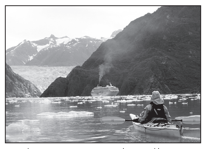
Cruise ship in Tracey Arm, Tracy Arm-Fords Terror Wilderness

At first I think it's a trick of wind and waterfalls. But the voice gets louder. Then, suddenly, it's very loud, telling me breakfast is being served...on the mezzanine.