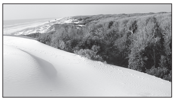
Cumberland Island Wilderness

Wilderness on the East Coast may not be as expansive, but it's just as important—especially to the 200 million people living within a few hours drive of its 84 Wildernesses. Some of the country's wildest and most biologically diverse Wildernesses are located in Georgia, including the Cohutta Wilderness in the Appalachian Mountains and the coastal plain's Okenefenokee Wilderness—one of the East's largest Wildernesses at nearly 354,000 acres. The new Georgia chapter of Wilderness Watch will initially focus on the