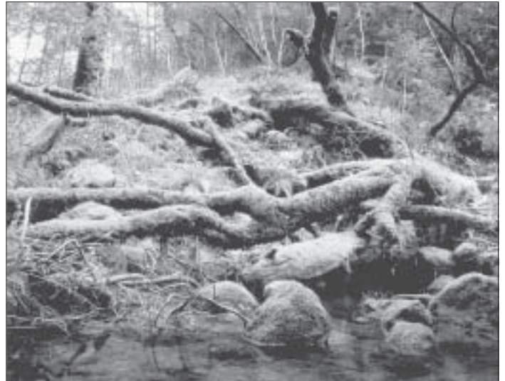
Tongass vegetation.

Wilderness Watch recently learned that the landowner