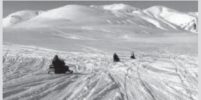
When snowmobiles were permitted into Alaska Wildernesses in 1980, no one predicted the technological advances that have made remote places accessible, such as here in Denali National Park and Preserve.