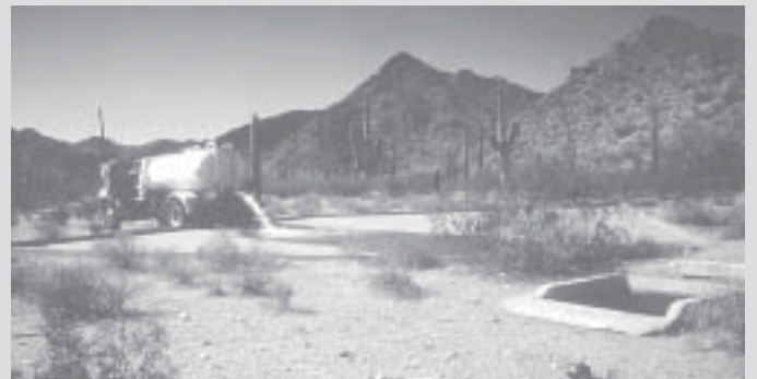
A water truck fills a wildlife "guzzler" in the Cabeza Prieta Wilderness, AZ. The guzzler requires a permanent vehicle route.