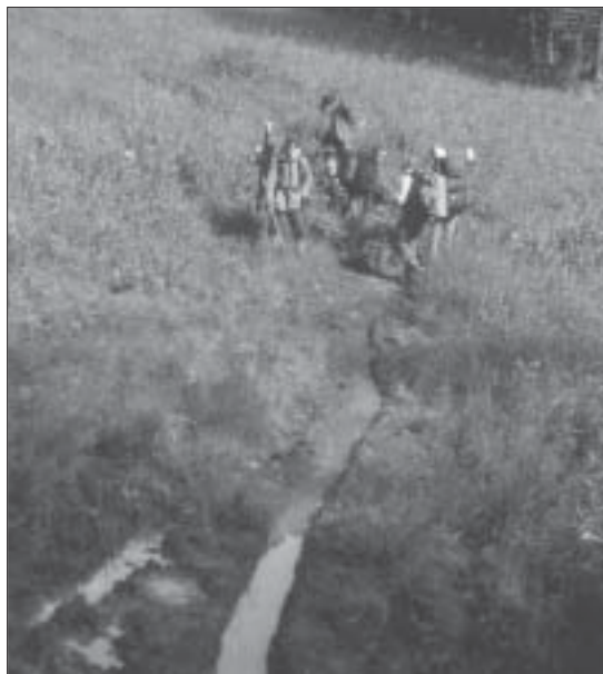
ORV damage, Hyalite-Porcupine-Buffalo Horn WSA.

Given the language in S-393 that requires preserving the areas' current (1977) wilderness character, and court rulings to