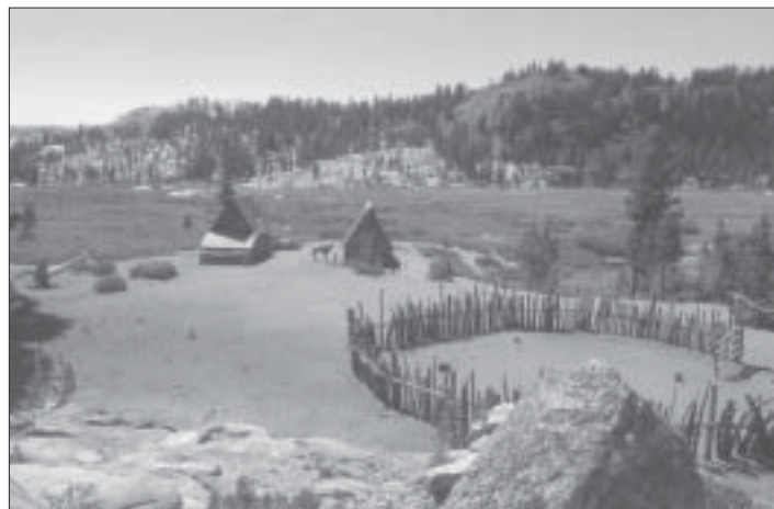
Line camp on a grazing allotment in the Emigrant Wilderness, CA. WW file photo.

Special provisions that have been included in Wilderness bills since 1980 are proving to be particularly damaging to wilderness character. In all likelihood, the impacts of these exceptions were expected to be small and carefully regulated at the time, but the reality has been far different. Relaxed restrictions on livestock grazing, expanded access to private inholdings, actions of fish and wildlife management agencies, and myriad other exceptions are resulting in consequences far beyond what could ever be considered as appropriate in Wilderness. Similarly, exceptions in some Wilderness bills coupled with rapidly expanding technologies, growing affluence among the general public, and the popularity of