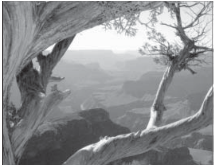
Citizen involvement could bring Wilderness protection to Grand Canyon Nat'l Park, AZ.

We are told the public has no idea what Wilderness is, that Wilderness is an elitist concept that locks up the land. After 40 years, the public has a limited or non-existent understanding of Wilderness and is not engaged in its management or preservation. Sadly, managers of Wilderness