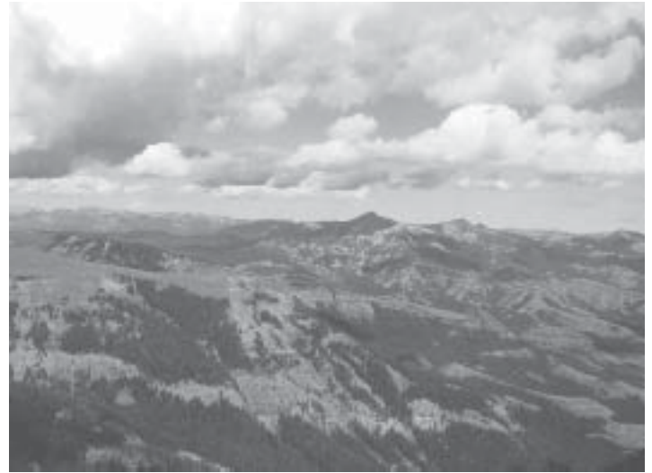
Hyalite-Porcupine-Buffalo Horn WSA, Montana.

The Forest Service has repeatedly violated both the spirit and intent of S-393. Throughout these threatened wildlands, the agency has encouraged increasing numbers of snowmachines, dirt bikes, and 4-wheeled ATV's. This has created erosion, stream siltation, weed invasion, air and noise pollution, and the disruption and displacement of various