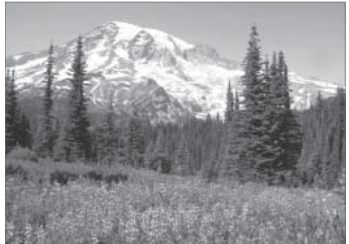
Mount Rainier Wilderness, WA.

One of the greatest emerging challenges to protecting the wild character is the preponderance of special provisions or non-conforming uses included in new Wilderness bills. These provisions not only allow activities within Wilderness that are inappropriate and degrade individual areas, but more importantly the cumulative impact of these provisions threatens to