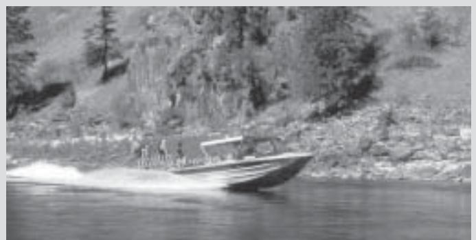
Special provisions allowed motorized recreation to skyrocket in areas, as seen here in the Frank Church-River of No Return Wilderness, ID.