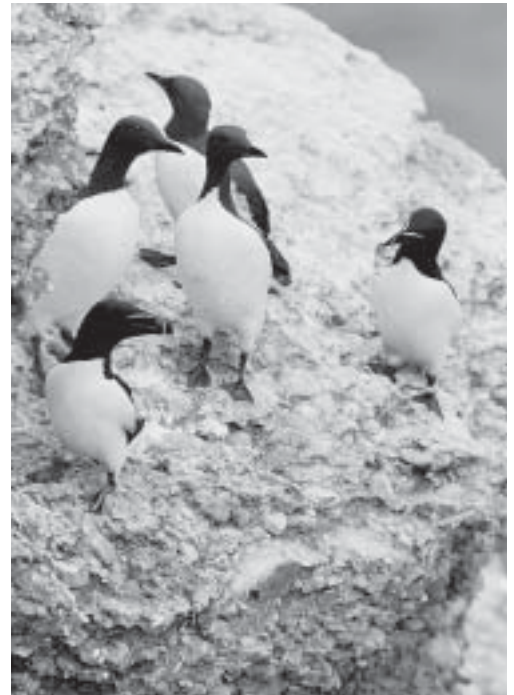
Murres.

This sentence recognizes that areas designated as Wilderness may have limited signs of past human influence and uses. However, the clear direction in the first sentence of Section 2(c) states that once an area is designated, human influence will be limited so that the earth and its community of life will remain untrammelled from that point forward. ♪