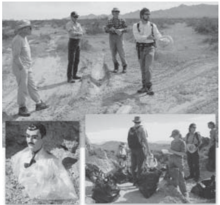
Crossroad of illegal tracks, Cabeza Prieta (top); smuggler shrine, Organ Pipe (left); trash collected in 20 minutes, Organ Pipe (right).

Our destination is a Border Patrol outpost along the Camino. As we bounce along we are regaled by stories of