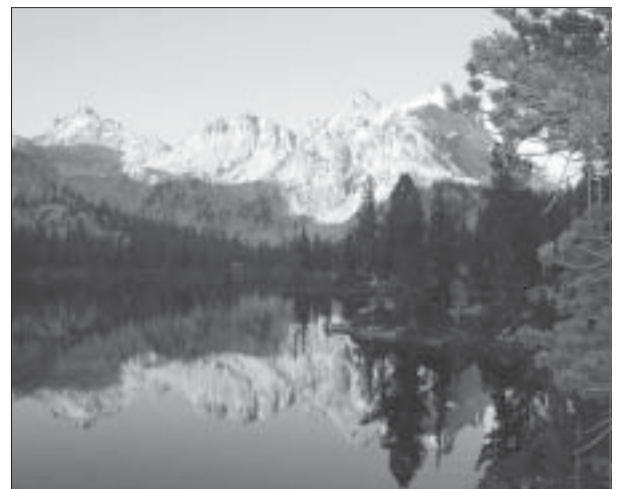
Sawtooth Wilderness, ID.

In January 2005 the Forest Service will host a Centennial gathering to chart the agency's course over its next 100 years. In preparation, the agency held a series of regional Forums, each focusing on a specific management issue. In November, the agency's national forum for Wilderness was held in Missoula to identify challenges and shape recommendations for future wilderness stewardship goals and priorities. Wilderness Watch and other non-agency groups joined with national forest managers to discuss ways to build a knowledgeable public constituency for stewardship, the role of scientific research in wilderness protection, and the skills and characteristics needed by wilderness managers. Some conclusions were that the social sciences should receive more emphasis in preparing wilderness managers, and the first constituency groups to target for building knowledge and support for stewardship are the people within the agency itself, and the conservation advocacy community. Recommendations from the gathering will be presented at the national Centennial in January 2005.