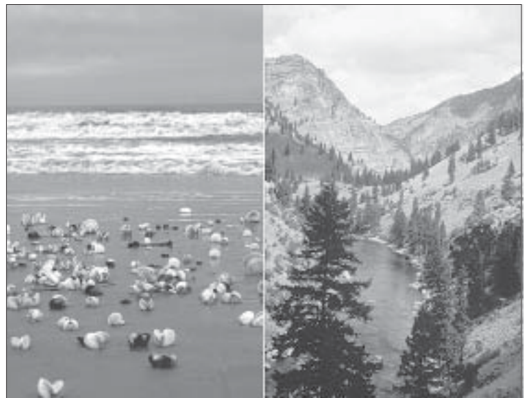
Cumberland Island, GA (left), Wild Salmon River, ID (right).

And though the country rose up in support of Wilderness, our shared enthusiasm could not withstand the onslaught of special interest dealing. Finding the ear of its Congressmen, commercial operations previously defeated in federal court sought permission to exploit key areas of the public's Wilderness in Idaho and Georgia. Their requests were granted by the 108 th Congress, in its lame duck session, through the last minute insertion of