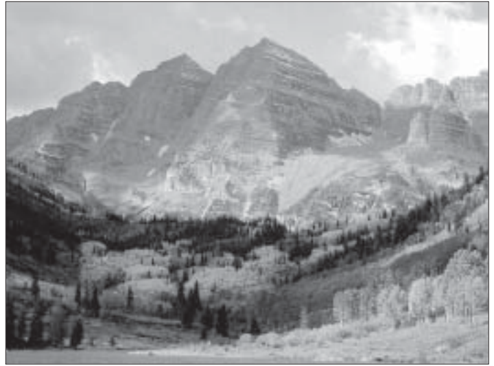
Maroon Bells - Snowmass Wilderness, CO.

Maybe the most important role of the public lands is to safeguard wilderness. Wilderness is at the core of a healthy society. Wilderness, above all its definitions, purposes and uses, is sacred space, with sacred power, the heart of a moral world. Wilderness preservation is not so much a system or a tactic, but a way of understanding the sacred connection with all of life, with people, plants, animals,