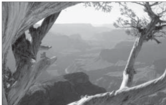
Grand Canyon Wilderness (proposed).

Though the Court did not find either the Forest Service or STC to be in contempt, it did express its concern and stated its intention to "develop its own temporary court ordered Special Use Permit". The Permit would be implemented for one year (12/20/04 - 12/20/05) and would