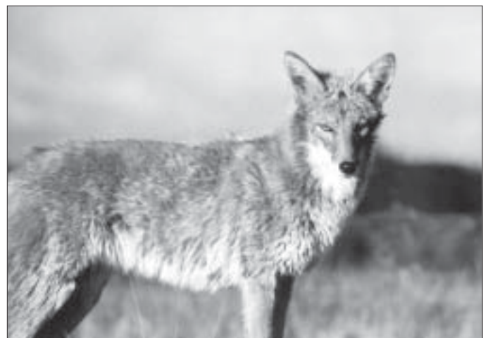
Coyote.