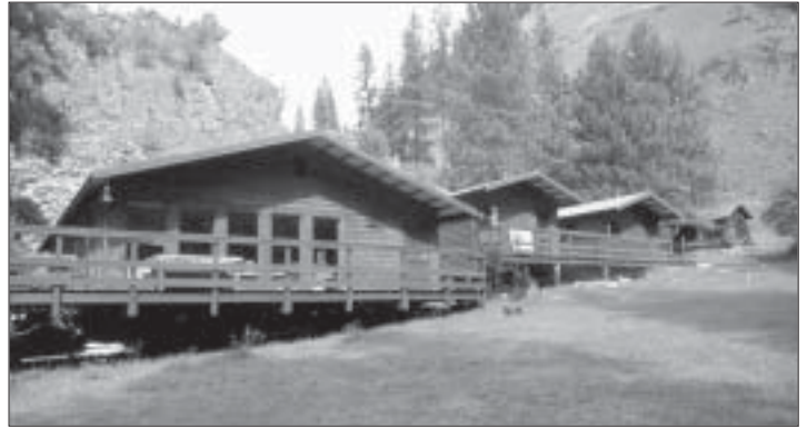
Permanent lodge on the Wild Salmon River. Wilderness Watch file photo.

Lightning bolt icon Cumberland Island Wilderness Boundary Adjustment Act of 2004: Strips wilderness protection from the Cumberland Island Wilderness by de-designating the existing wilderness, then re-designating certain disconnected parcels as wilderness, carved up by unpaved 1-lane tracks where motor vehicles will be allowed to drive.