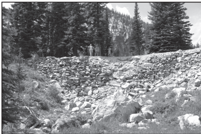
Wilderness Watch and the Forest Service discuss the future of the Fish Lake Dam in the Selway-Bitterroot Wilderness, MT

W e don't often have the opportunity to restore the wild qualities of Wilderness lands. What normally crosses our desks or comes to us by phone or email is the latest threat to a Wilderness, be it a misguided agency plan or action, or some outside influence seeking to use Wilderness for purposes other than allowed by the law.