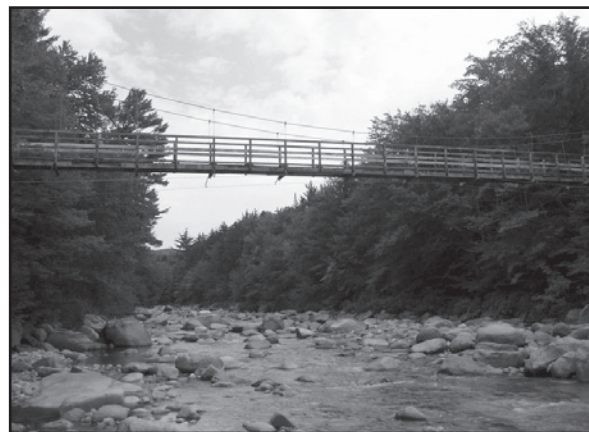
Bridge to be removed in the Pemigewasset Wilderness, NH

Wilderness Watch supported the FS in our written comments stating the proposed action meets the Wilderness Act's statutory requirements to preserve the area's wilderness character. We acknowledged that while the FS administers the area for recreational, educational, or other purposes, it must do so in a way that preserves wilderness character. Removing the bridge meets this test. We applauded the agency for proposing to take the right course of action.