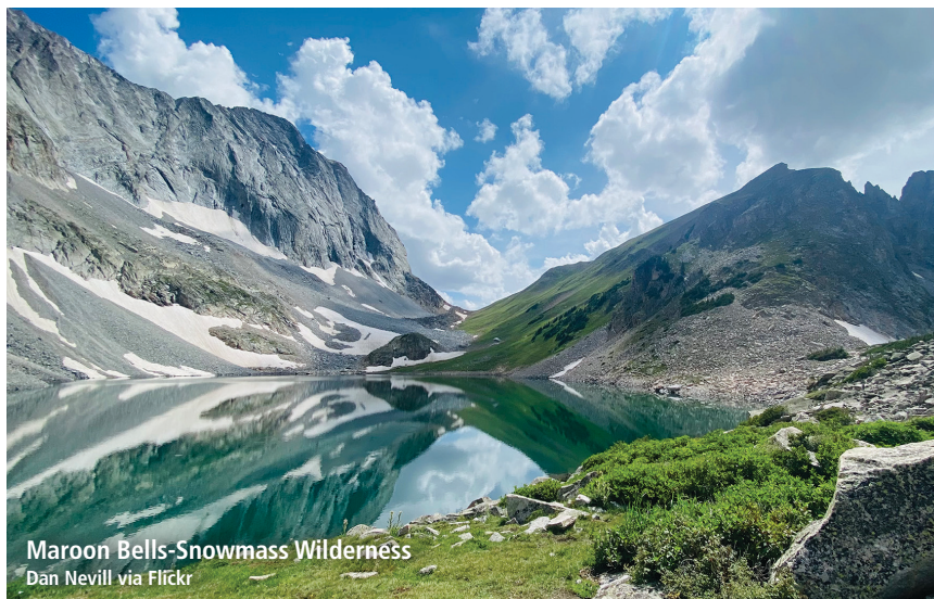
Maroon Bells-Snowmass Wilderness

The Wilderness Act advanced an alternative policy approach; it bars commercial enterprise, for example. And in another wise move, Congress guaranteed that most public lands are free for anyone to access. The Federal Lands