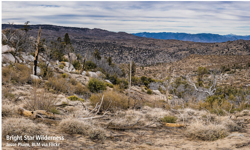
Bright Star Wilderness

The agency proposes a plethora of activities incompatible with Wilderness—helicopter landings, chainsaws, and drones to ignite an undetermined number of fires over 15 years. These activities violate a fundamental tenet of Wilderness—that it remains “untrammeled.” BLM should drop this plan and instead let natural fires shape the Powderhorn. 🌿