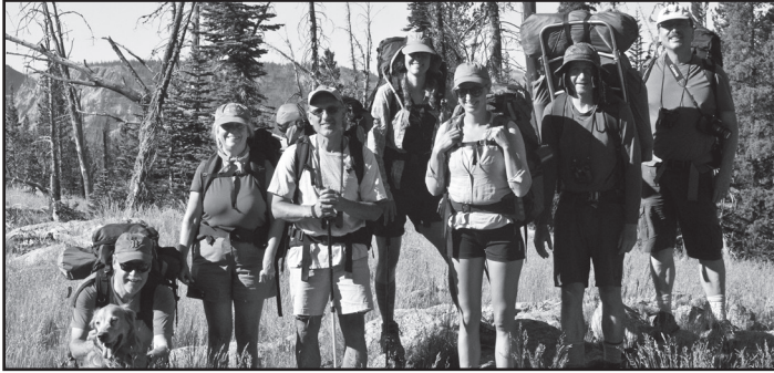
In July Wilderness Watch backpacked into the site of the proposed Golden Hand Mine in the Frank Church-River of No Return Wilderness, ID.

On July 7, Wilderness Watch and several other conservation groups filed a lawsuit challenging the Forest Service's authorization of extensive drilling, bulldozing, road construction, and motor vehicle traffic in the Frank Church-River of No Return Wilderness. American Independence and Mineral Mining Company (AIMMCO) wants to explore whether an old mining claim from the 1880s is viable. The River of No Return Wilderness in cen-