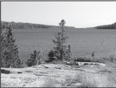
Photo: Moskey Basin