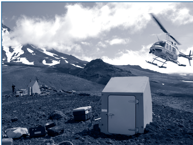
Research installation in the Unimak Wilderness.

The Wilderness Act does offer one very narrow exception for these prohibited activities. Only if the proposed research is the minimum required for the protection of the area's wilderness character—unlikely in nearly all instances—can managers allow these violations to occur. Adding new climate change monitoring stations in a Wilderness does not protect the area's wilderness character. Just the opposite! While the information acquired by such monitoring stations may be interesting or useful to understanding climate change, it generally does not help the wilderness manager protect the area's wilderness character.